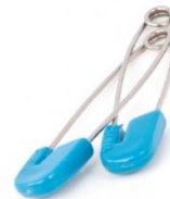
Two diaper pins or large safety pins