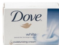
Two or three bath-size bars of gentle soap equaling 8-9 oz.