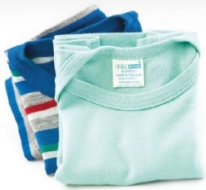
Two lightweight cotton T-shirts