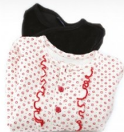
Two long- or short-sleeved gowns or sleepers