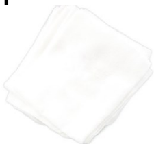
Four cloth diapers, flat fold preferred