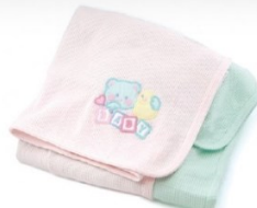
Two receiving blankets