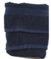
One hand towel, dark color recommended

Please bring any of these items to the church or donate money toward shipping. Thank you!