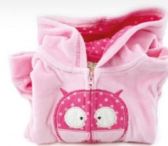
One jacket, sweater or sweatshirt with a hood, or include a baby cap