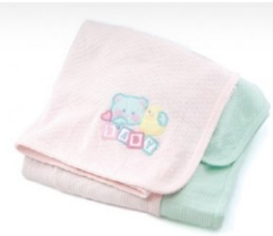
Two receiving blankets