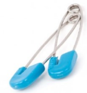
Two diaper pins or large safety pins