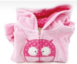
One jacket, sweater or sweatshirt with a hood, or include a baby cap

Please bring any of these items to the church during Lent or donate money toward shipping. Thank you!