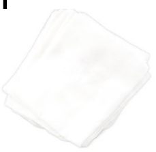
Four cloth diapers, flat fold preferred

Please bring any of these items to the church during Lent or donate money toward shipping. Thank you!