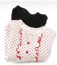
Two long- or short-sleeved gowns or sleepers