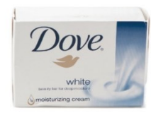
Two or three bath-size bars of gentle soap equaling 8-9 oz.