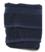
One hand towel, dark color recommended