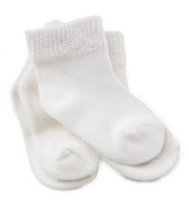
Two pairs of socks