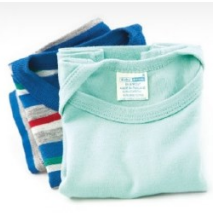
Two lightweight cotton T-shirts